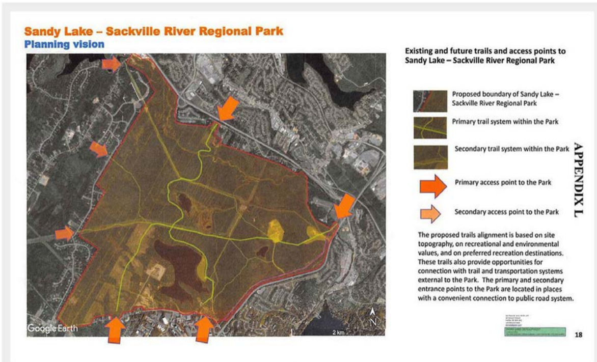
Fig 5. The proposed Sandy Lake – Sackville River Regional Park lies between growth areas on all sides. What a precious gift to future generations that would be. Map from Appendix L in the RP+10 Submissions (2020) from the Sandy Lake – Sackville River Regional Park Coalition. This version of the park is not very different from that detailed in 1979 – surely its time has come.

Surely for the sake of Sandy Lake & Environs remaining a precious recreational and ecological asset within a 'Growth Landscape', we can place the currently proposed development on some of the already ecologically degraded lands or lands of much lower ecological value in the same general area – and there appear to be `ample of them - and take the steps needed to finally realize a Sandy Lake – Sackville River Regional Park.